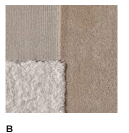
Beige White "Conchiglia" white