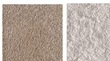
Short pile - beige