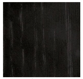
Black stained open pore ash